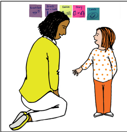
Plan the Day

Print and cut these icons to create a daily schedule. Keep your plan for each day simple. You can always add more activities if there is time and interest, but it feels good to complete a plan!