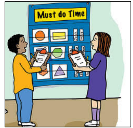
Must Do Time